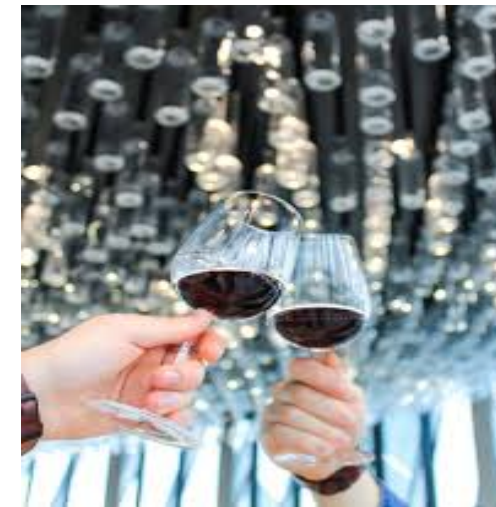
BORDEAUX CITE DU VIN & WINE TASTING