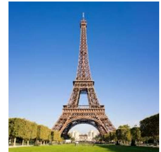
LAST WEEKEND IN PARIS (optional)

Icam's pro-active and inductive pedagogy will immerse you in real life experiences to boost your comprehension of the French culture & environment, to foster team building and reflection upon your own contribution to our fast changing world.